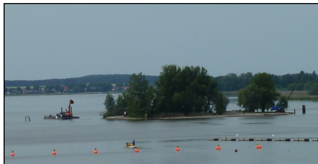
The "shifted" island: The 27 m gained for the additional lanes by the excavation can be clearly seen to the left of the image.