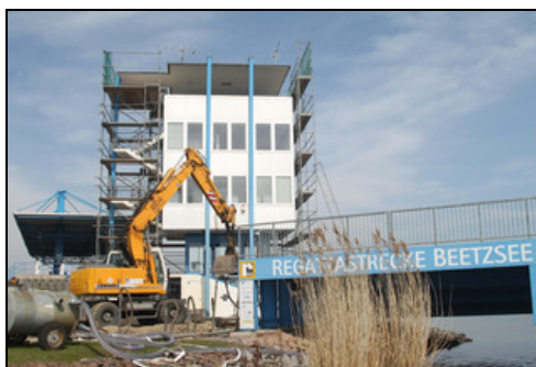
Before the foundations were poured, the groundwater level had to be lowered in an elaborate operation in Spring this year.