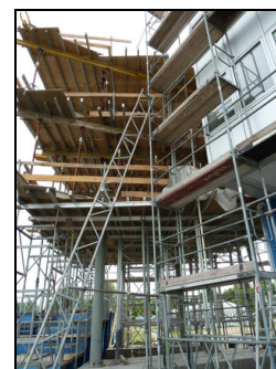
June 2010: The construction of the new tower is progressing.