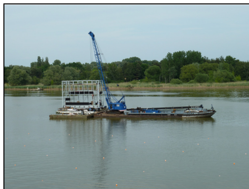
The enlarged video wall with heavyweight technology is being constructed at a new location in the middle of Beetzsee Lake.