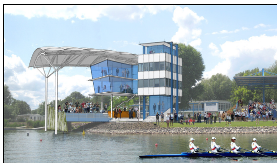
This is how the new double finish tower will look like: a successful combination of the historical structure with modern architecture.

organisers. The two parts of the building will be connected on the individual floors. In addition, all rooms will be equipped with state-of-the-art air-conditioning in order to provide a pleasant environment in which to work in, particularly during the summer months. A modern roof structure will also span across the VIP stand.