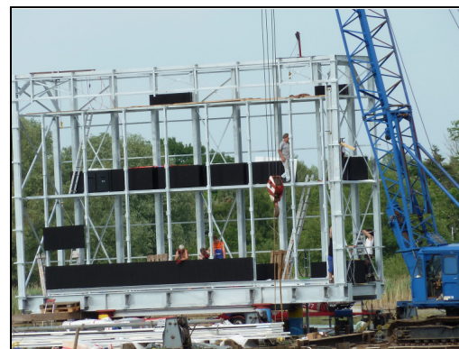
Technicians fixing the new video display screen's high-tech and powerful modules to the 8 x 12 m steel frame.