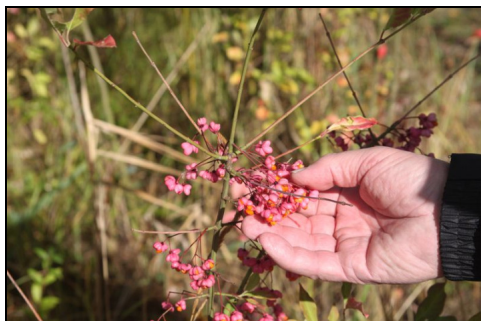
Spindle ( Euonymus europaea ) with its red seed capsules also grows on the island and was protected.