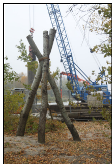
Heavy technology in operation. "Tepees" protect the plants.

The city and state of Brandenburg jointly invested around half a million euros in shifting the island. The new shore area is still undergoing the so-called settling phase. Only when this is completed will it be possible for leisure boaters to set course to "Acapulco".