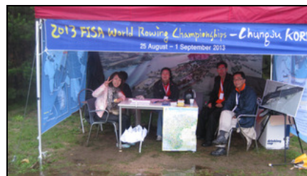
Best wishes from the Korean team

application was withdrawn in favour of Amsterdam. The fact that the Brandenburgers are good "losers" was recently shown once again in Račice where friendly contacts were made and experiences shared with the delegation from Chungju in Korea, against whom they "lost" in 2009.