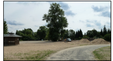
The transformation of the recreational facilities next to the boat park has begun. For the time being, Brandenburgers will have to seek out one of the many other bathing spots.