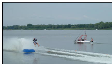
In just bare feet, the water-skiers speed across the water and up the ski jump at almost 80 km/h. A new world record has been set at 29.90 metres.

The fact that Beetzsee Lake also provides ideal conditions for this spectacular sport has been proved by the various world jumping records achieved here. The representatives from the International Waterski & Wakeboard Federation were overwhelmed by the excellent competition conditions and the sporting enthusiasm and hospitality shown by the people of Brandenburg.