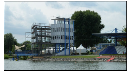
The new extension to the prominent finish tower can already be made out