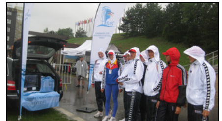
Despite the wind and rain, many athletes and officials in Račice were also keen to find out about Brandenburg's World Championships candidacy

A delegation from Brandenburg also attended the Junior World Championships in Račice in the Czech Republic. Despite incessant rain, which prevailed throughout the entire World Championships weekend, the three-man team managed to draw the attention of the athletes, trainers and officials to Brandenburg's World Championships candidacy. Because the bad weather prevented them from setting up the pavilion usually used, the boot of a Mercedes was quickly converted into an information stand.